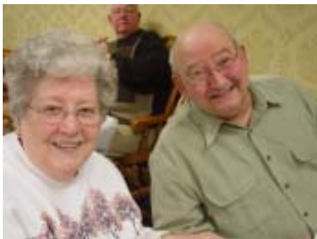
Haven I Residents

The menu for the events was Stuffed Chicken Breast, Orange Roughy Florentine, Party Mashed Potatoes, Carrots Excellence, spiced apple rings, cranberry salad, holiday muffins and assorted cheesecakes.