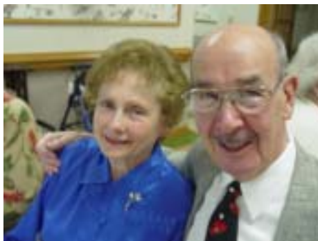
Haven III Residents