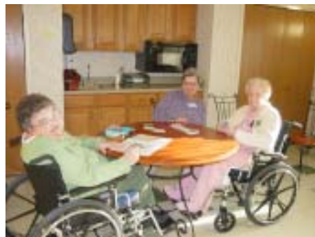
Moving day for Skilled Care residents.

The response from the local and surrounding communities has been overwhelming, with individuals and congregations donating so many articles of clothing that Concordia was forced to stop accepting them due to space constraints. For those wishing to assist the residents in the most effective way possible, Concordia has established the Resident Recovery Fund, which goes directly to those residents with the highest need.