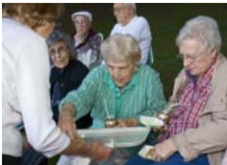
September's Special Party - Monday, September 11 at Haven I

Haven Bon Fire - Friday evening, September 8 th behind Haven I, nearly 100 residents enjoyed toasting marshmallows and hot dogs as nostalgia permeated the smell of embers and fall.